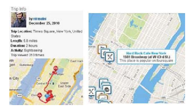
Figure 1. An example of semantic tag of spatial information.

To realize our observation into our classification model, we extract features of places in four aspects: 1) Spatial Property, 2)