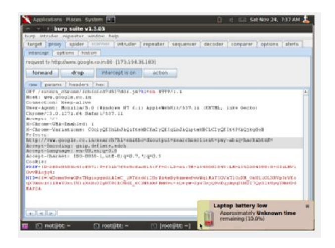
Snapshot 2: Session hijacking of Gmail